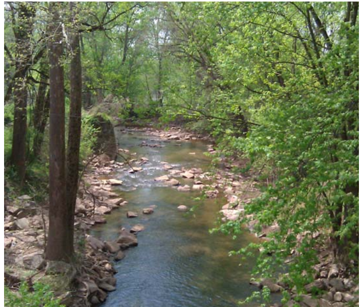
Armstrong Creek before entering the Susquehanna River.

Conley Run, a tributary of Armstrong Creek, is a CWF from its headwaters to where it enters the main stem. Armstrong Creek is classified as a Warm Water Fishery (WWF) with a section of the main stem and several relatively small tributaries listed as impaired by siltation caused by agricultural activities. The Creek is a Trout Stocked Fishery (TSF).