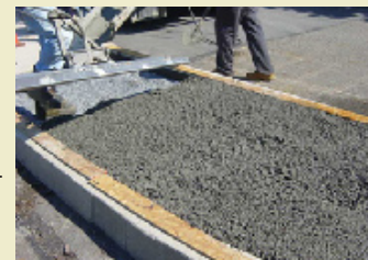
4. (above) Concrete is leveled with a screed.