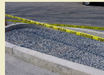
2. (above) Stone base layer is poured, spread and graded.