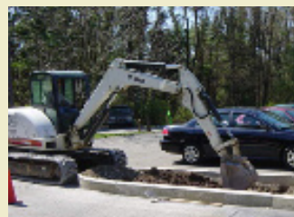
1. (above) Site is excavated.