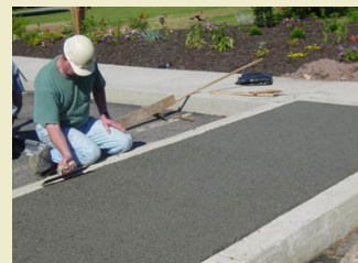
5. (above) Work edges and surface to a clean finish.