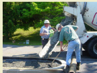
3. (above) Concrete is poured and spread.